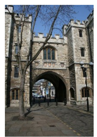
St John's Gate, Clerkenwell

PRICE: £62 per head to include the coach, all tours and tips.