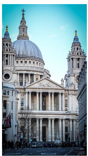
The West Front, St Paul's Cathedral