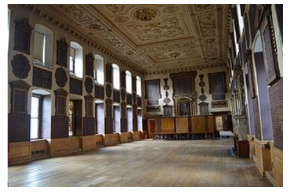
The Great Hall, St Bartholomew's Hospital

11.30am - Guided tour of St. John's headquarters (in two groups). The Vicar, who has arranged the visit, is an Officer of the Order of St. John and Sub-Dean of the Priory of England and The Islands. It is believed the Order was founded in the 12th century.