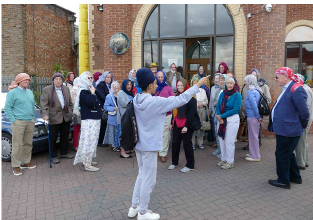
Friends suitably attired for the Gurdwara

After a short break for lunch at a local hostelry, we were driven the short distance to the Sikh