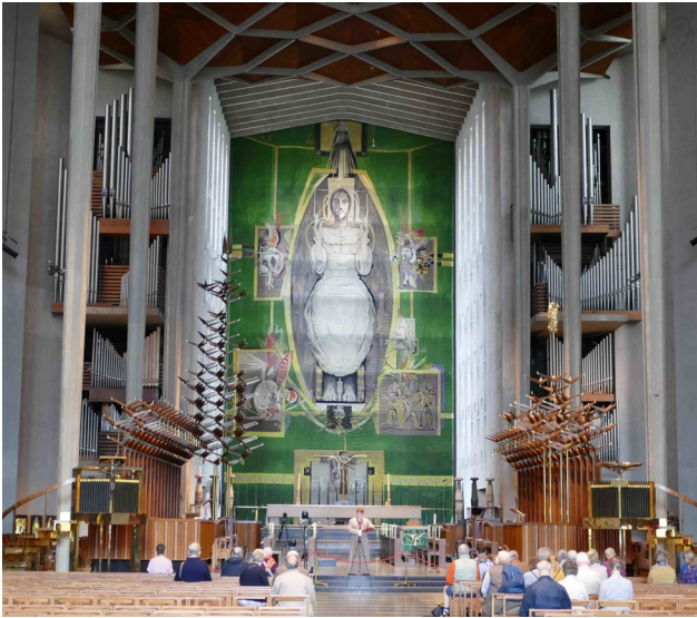
Friends attend the Litany of the Cross of Nails

heard about the air raid on the night of November 14th 1940 when incendiary bombs rained down on the Cathedral destroying most of its structure, though leaving the tower and spire intact. Following the destruction of the Cathedral a competition was launched to design a replacement. That competition was won, of course, by Basil Spence, whose new Cathedral, consecrated in 1962, now sits alongside the ruins of the old. We were then taken into the light, spacious interior of the Cathedral, just in time to participate in the Litany of the Cross of Nails. This takes place daily at noon and is centred on the need for forgiveness and reconciliation, which is at the heart of the Cathedral's current ministry. We were given time to take ourselves round the building to experience its beauty and symbolism, whilst also listening to a splendid organ recital.