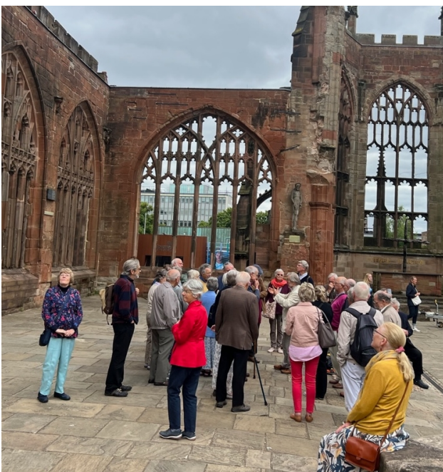
Friends in the ruins of the medieval Coventry Cathedral